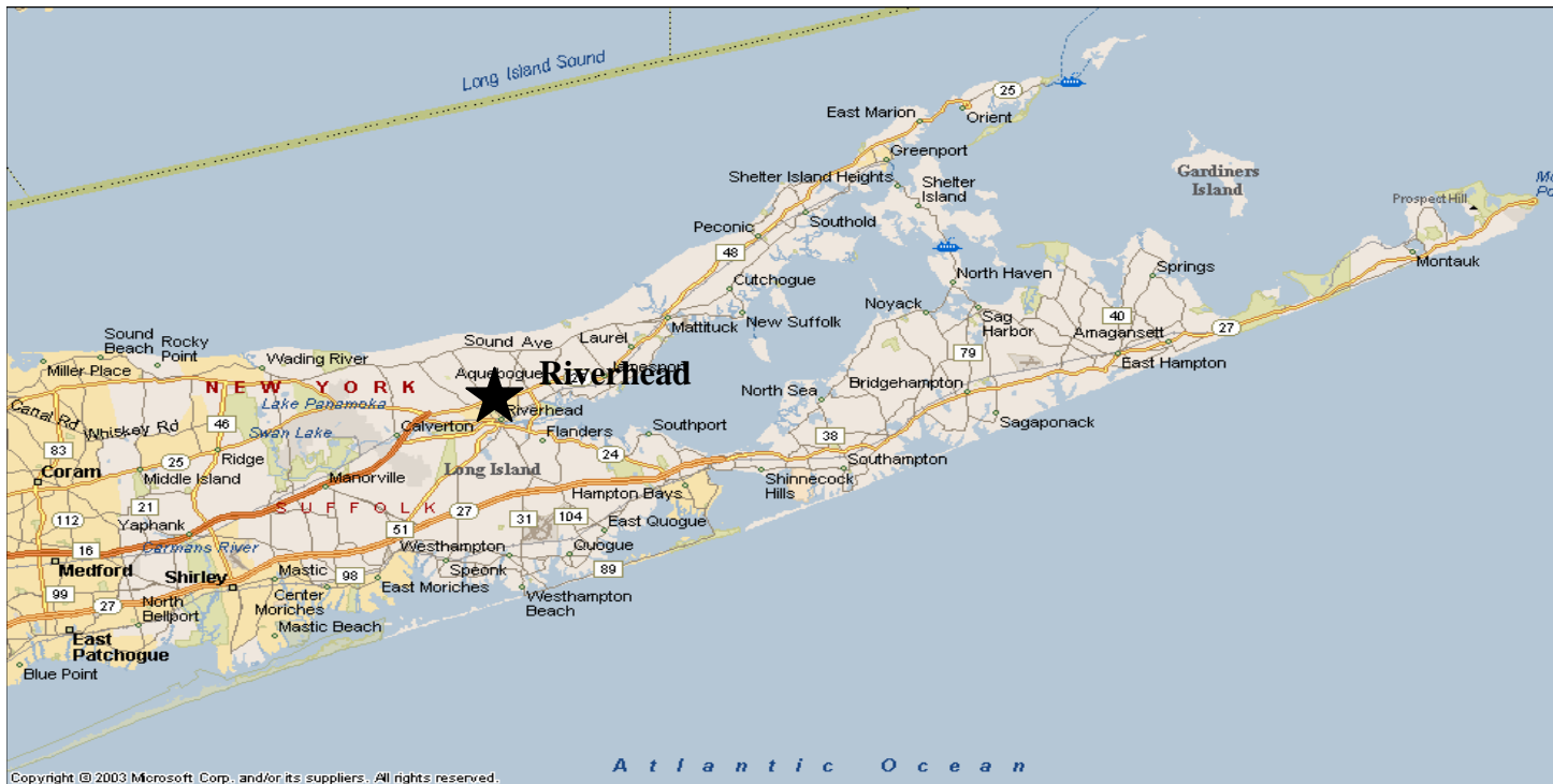
Riverhead Location Map

Three major airports serve the region, making Long Island a gateway to business and leisure travelers. Within Suffolk County, the Long Island MacArthur Airport offers service by several regional carriers.